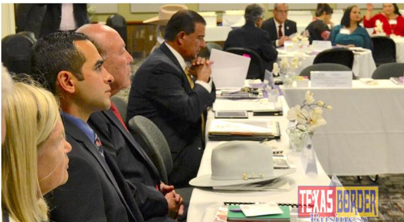
Law enforcement from across the region offered their input at the first President's Advisory Council Luncheon on April 27.

federal professionals in law enforcement, public safety, fire safety and Homeland Security along the US/Mexico border.