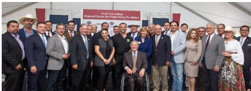
New Regional Center for Public Safety Excellence puts STC at the forefront of training the next generation of border security professionals

The new Regional Center intends to make STC the first border community college in the nation to establish integrative training along the US/Mexico border while meeting the demand for professionals seeking careers in public safety, law enforcement, fire science, and Homeland Security.