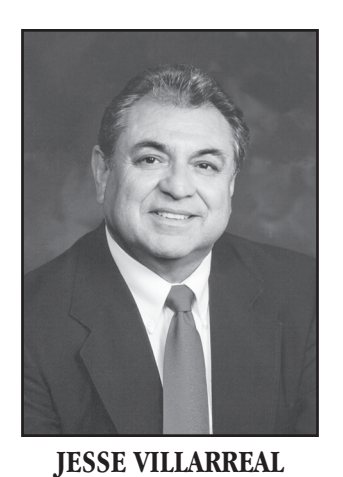
Secretary Parental Involvement Department, Weslaco ISD District 6 Representing Donna, South Alamo, South San Juan, South Pharr, Weslaco and Progreso Elected May 2000